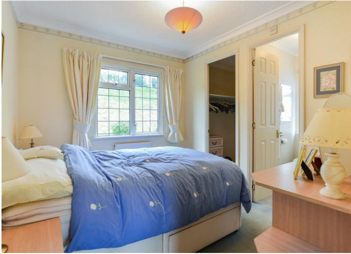
Bedroom One 9' 7" x 8' 6" (2.92m x 2.59m)