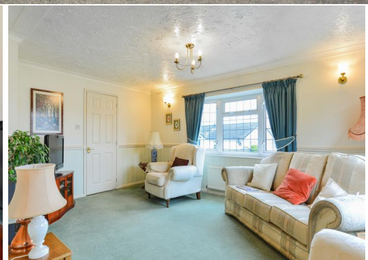
Allocated Parking At Front Suitable For Cash Buyers Only

The Promenade, Moss Lane Moore, Warrington, WA4 6FX