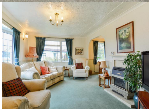
Two Double Bedrooms Ensuite + Bathroom