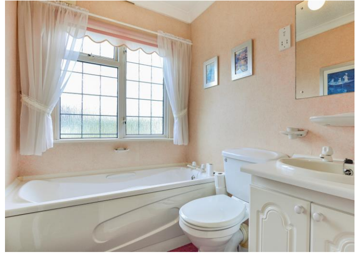
Bathroom 6' 6" x 5' 7" (1.98m x 1.70m)