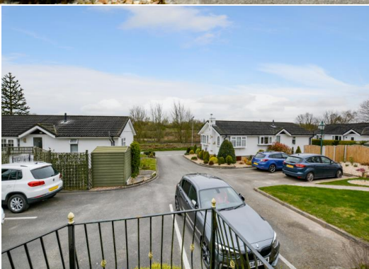
Well Maintained Park Home Excellent Cul-De-Sac Position